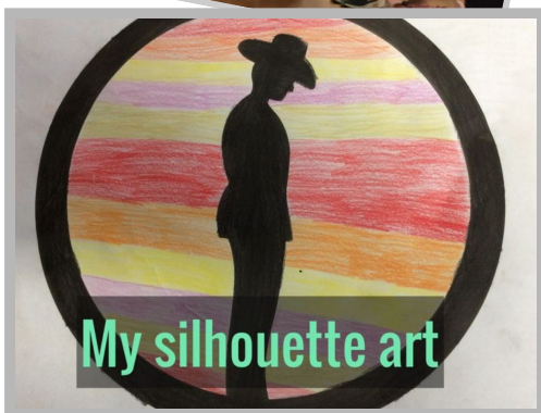
My silhouette art