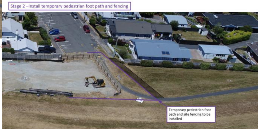
Works that impact Boulcott Primary School will be conducted between 9am-3pm