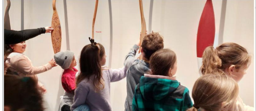
We liked looking at the different hoe (paddles) and touching them. We talked about our favourite hoe and explained why we liked it. Lots of us liked the ones with detailed carvings. These hoe were all named after different whetū (stars).